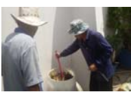
Compose organic waste