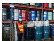
Audit waste disposal company