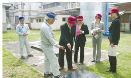
Tochigi Plant of KUBOTA Air Conditioner Co., Ltd.