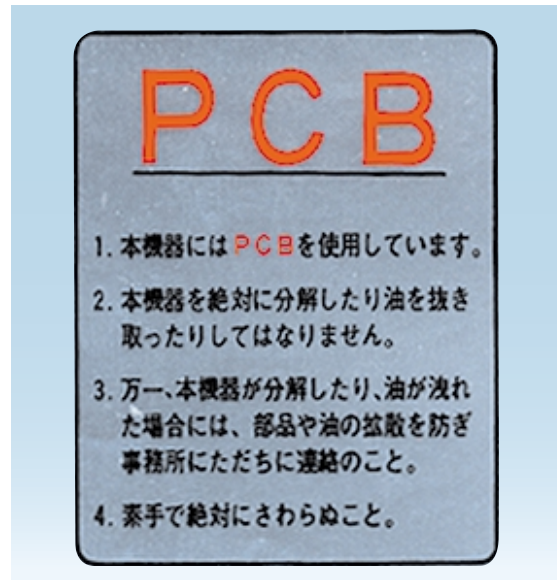
A label attached to the equipment containing PCB