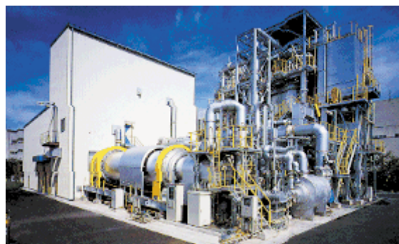
Gasification and melting furnace

Our gasification and melting facility has been developed as a system that can maximize the energy saving rate and recycling rate.