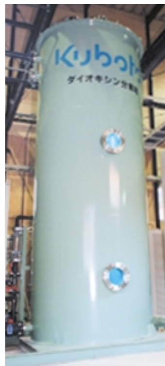
Dioxin Decomposition Tower