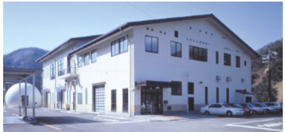
Shimoina-gun recycling treatment center "West Clean Hill" in Nagano prefecture (completed in March 2000)

We at Kubota can generate electric energy or heat energy such as hot water, from co-generation system using methane gas that is converted efficiently from these organic wastes, in the center.