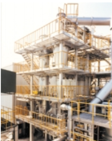
Circulating fluidized bed furnace

The system contributes to the reduction of CO 2 emission, by energy saving such as reduction of electricity and auxiliary fuel consumption.