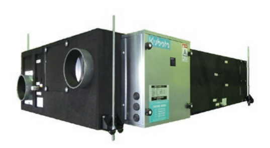
Appearance of the humidity control outdoor-air processing unit

The Kubota Group has developed a humidity control outdoor-air processing unit equipped with an apparatus to switch flow paths by changing the direction of the moisture absorption/desorption block, thereby realizing the substantial downsizing of and energy saving in desiccant air-conditioners.