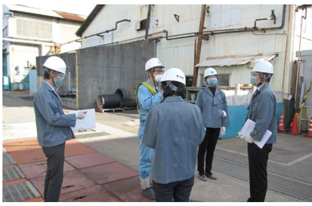
Kubota Hanshin Plant Mukogawa Site